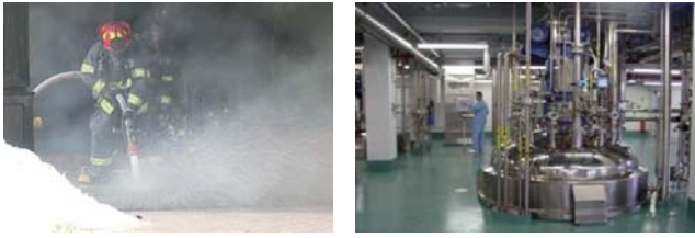
Fig. 2. a) Basement garage and underground fire; b) Manufacturing floors with risk of hazardous substances leakage.

of robotic architectures in SaR scenarios; (ii) model cooperation in teams of FRs; and (iii) evaluation of cooperative architectures for teams of FRs and rescue robots.